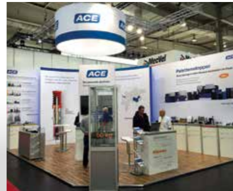
ACE booth – on our website you can find out at which trade fairs we are represented. We look forward to your visit.