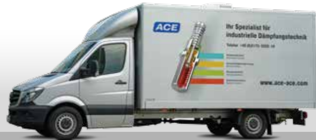
ACE demonstration vehicle – your free trainings on premises. We will give you a demonstration on your parking place, you supply a 230V power connection.